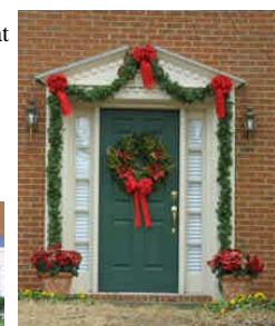
A welcoming front door