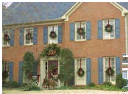
Good enough to eat