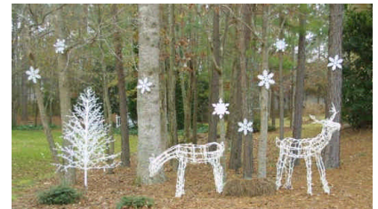
The deer were traffic-stoppers at this festival of lights

2857 Wynford Drive 1265 Wynford Colony 3036 Wynford Station 3108 Wynford Gable